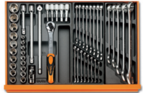
T80 T05 T06